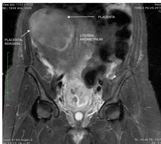
Figure 2- Coronal T2 image shows a well-defined, hyper intense lesion the fundal and right lateral region of uterus communicating with the endometrial cavity. There is loss of normal myometrial signal at fundus and along the right lateral wall between placenta and myometrium with focal bulge which suggests placental invasion.

Uterine bulge/ placental lump and thinning of myometrium were seen in maximum patients i.e. 10 out of 11 patients followed by Myometrial disruption seen in 9 out of 11 patients (Figure 2).