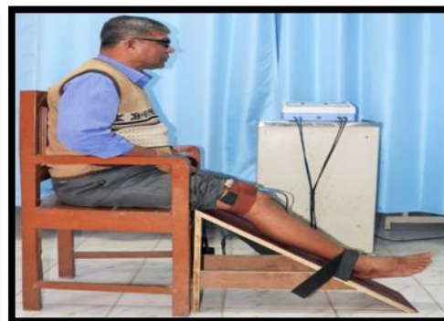
Fig:2 Application for Russian current