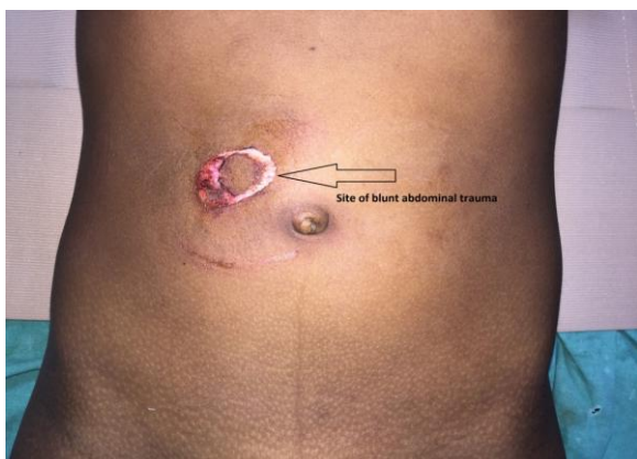
Figure 1 Site of blunt abdominal trauma (anterior view)