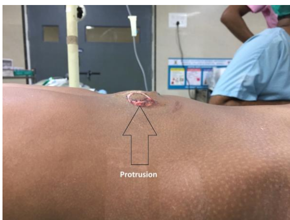
Figure 2: Showing lateral view of blunt abdominal trauma