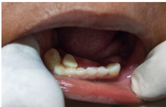
Fig. 2 intraoral picture showing displaced right mandibular deciduous canine

On intraoral examination deciduous right mandibular canine was displaced there was mobility of alveolus of right anterior mandible. [Fig.2]