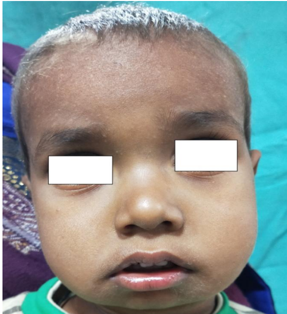
Fig.1 extra oral picture showing bilateral mandibular swelling

A 4 year old male patient reported in the department with swelling in right and left lower jaw since 6 months. . [Fig.1]