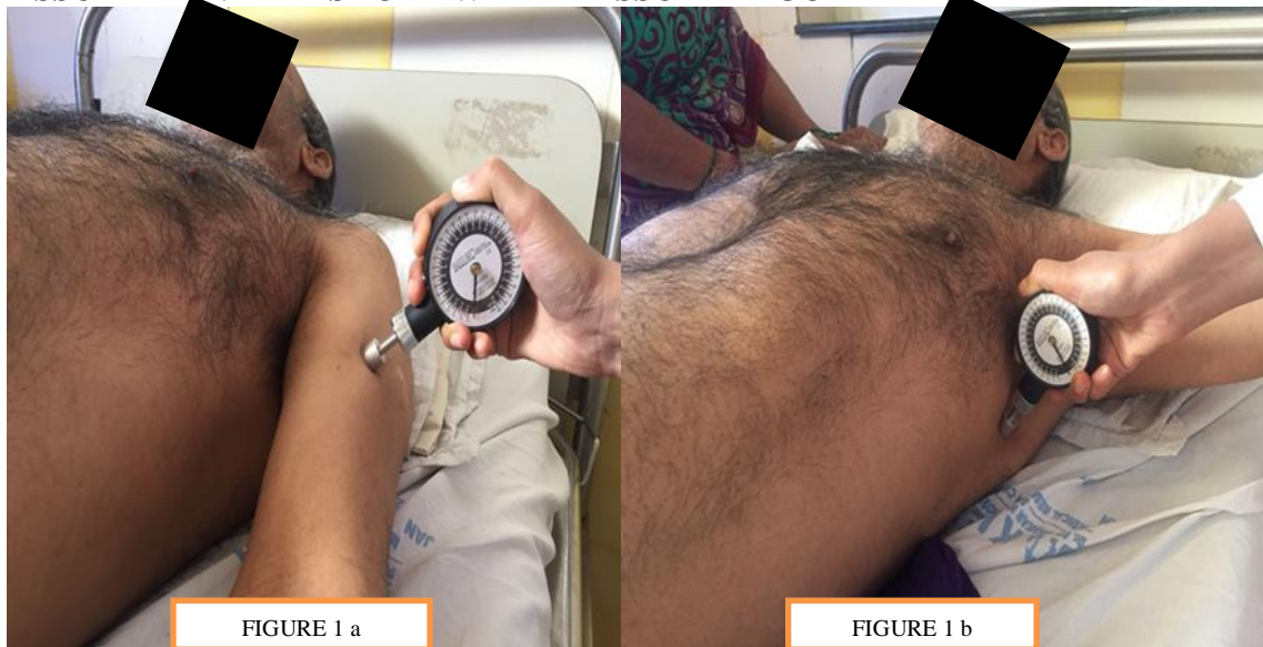
Fig 1 a – PPT of Deltoid muscle using pressure algometer Fig 1 b – PPT of subscapularis muscle using pressure algometer