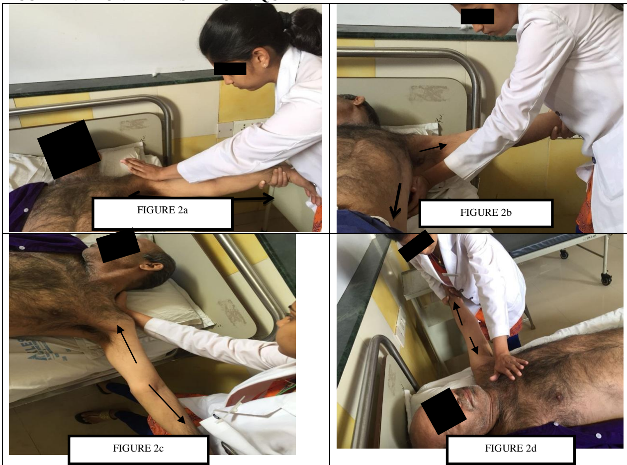
Fig 2a – Arm pull + Focused MFR to Deltoid muscle. Figs 2b – Arm pull + Focused MFR to subscapularis muscle Figs 2c – Arm pull + Focused MFR to trapezius muscle Figs 2d- Arm pull + Focused MFR to pectoralis muscle