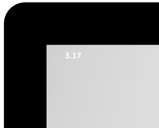
Figure (3): illustrate the mean values of plaque index (PD) in both sites treated by SRP/CoQ10 and SRP only.