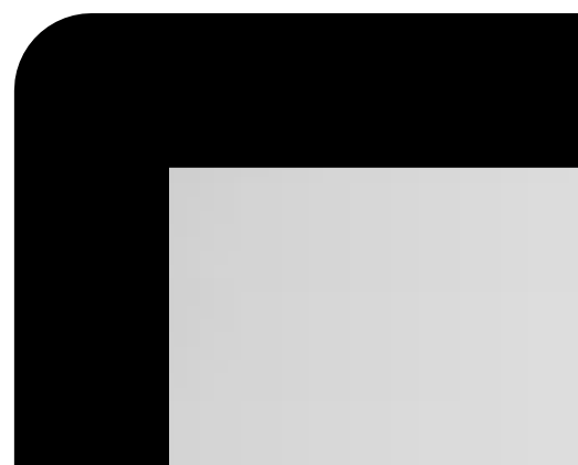
Figure (4): illustrate the mean values of clinical attachment loss (CAL) in both sites treated by SRP/CoQ10 and SRP only.