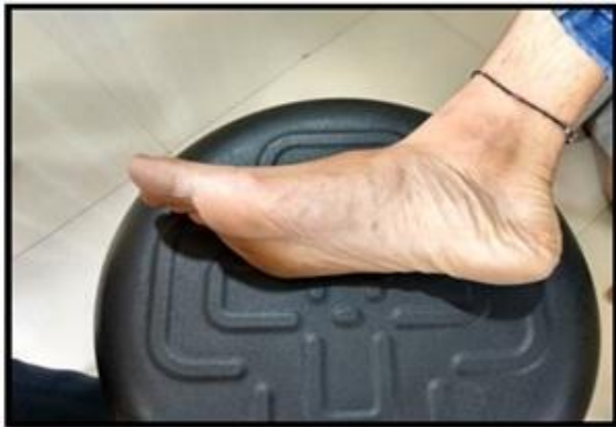
(fig. 1) Pes planus (flat feet)