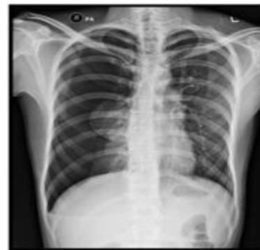
(fig. 5) right-sided pneumo