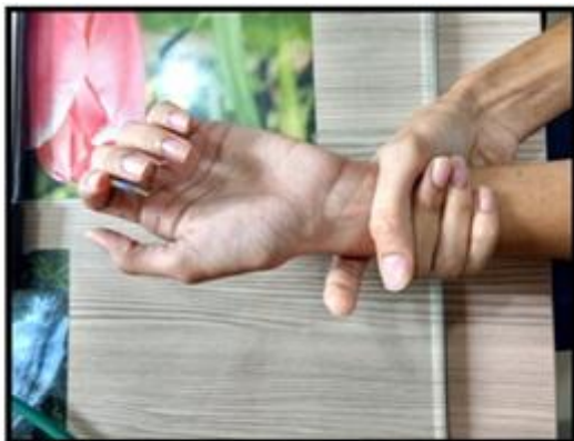
(fig. 2) Positive wrist sign(walker's sign)