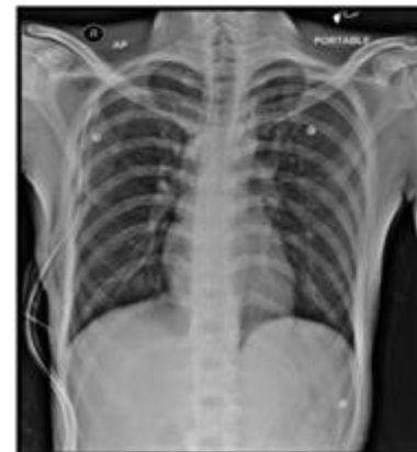
(fig. 6) after ICD insertion