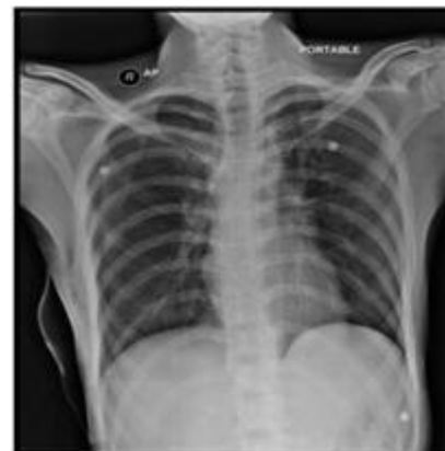
(fig. 7) ICD removal