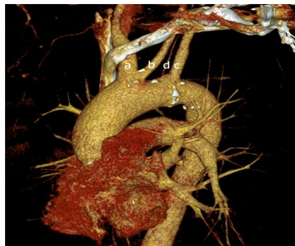
d. Type 4