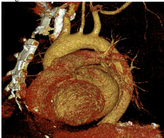
a. Type 1

In an anatomically normal case, the brachiocephalic trunk, left common carotid artery and left subclavian artery arise from the arch of aorta from the right to the left. In this study, a normal branching pattern was termed as Type 1 and was seen in 721 patients (67.38%) (Figure 1).