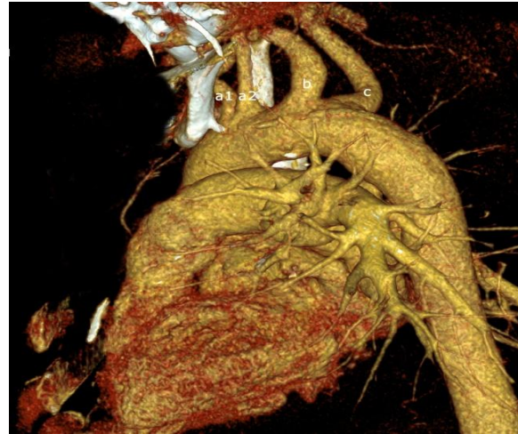
f. Type 6