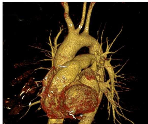
b. Type 2