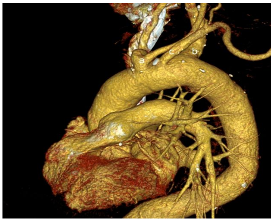
g. Type 7