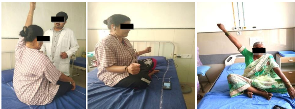
Shoulder exercises and hand pumps along with music therapy

Dosage: Each exercise was performed for 5 repetitions, with 1 minute rest and 10 minutes regime.