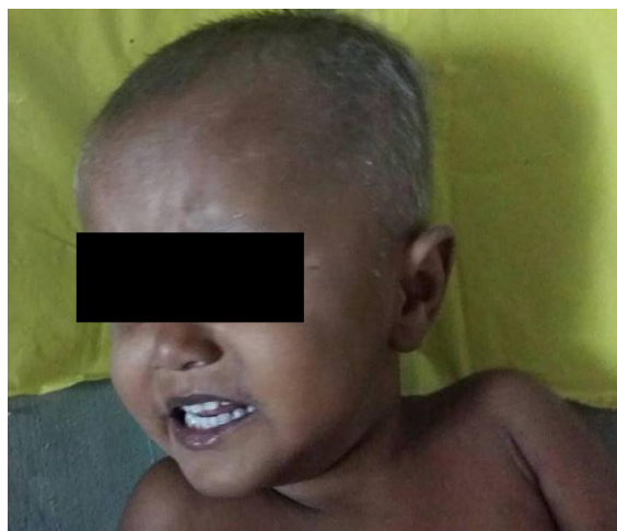
Fig. 1: Child presenting with grey colored hair.

diagnosis of griscelli syndrome. Confirmation can be provided by mutation analysis of the patient's DNA. [2]