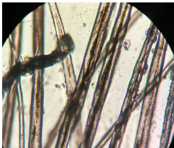
Fig. 2: Microscopic features of a hair follicle demonstrating clumping of melanin pigment along the shaft.