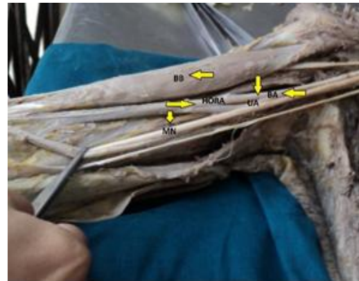
Fig: 1 HORA 13.5cm above the intercondylar line

along with brachioulnar artery and medial nerve then at a distance of 10 centimeters above the intercondylar line it crossed superficially the brachioulnar artery and median nerve.