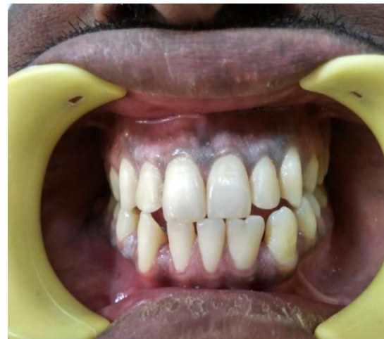
Fig 1: clinical image

symptoms. On general examination, the patient was well oriented to time, place and person. On intra oral examination, it was noticed that only 3 incisors were present in the mandibular arch and 32 was found to be missing. It was also observed that left permanent mandibular central incisors were abnormally large in size with increased width mesio-distally. (Fig: 1) The patient's medical history was uneventful and was unaware of this dental irregularity and gave no history of any pain or discomfort associated with it. Thorough family history did not reveal any congenital dental anomalies and the accompanied parent had a normal permanent dentition. On the basis of the clinical findings, a preliminary diagnosis of fusion was made i.r.t 31 and 32.