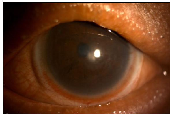
Figure 5: After fitting scleral contact lens

Figure 4: Extreme photophobia and irritation in patient with SJS – before fitting scleral contact lens. Figure 5: Symptomatic relief after scleral contact lens wear.