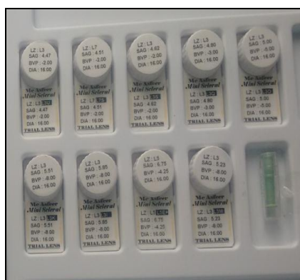
Figure 1: Miniscleral Lens

Ocular pathologies included: keratoconus, pellucid marginal degeneration (PMD), post radial keratotomy, Stevens-Johnson syndrome, post traumatic corneal scars, chronic blepharokerato conjunctivitis and high refractive errors.