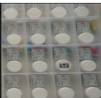
Figure 2: Semiscleral Lens

All lenses were fitted by a preformed technique. The following semiscleral and mini scleral lenses were used.