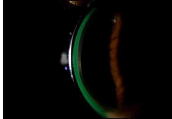
Figure 3: Positive Fluid-Venting Test

test was considered positive (Figure 3). If no fluorescence was seen – the test was considered negative. A Positive fluid venting test correlates well with successful scleral contact lens wear.