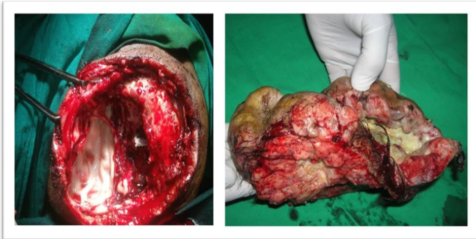
Fig 3:Intra operative complete excision of tumor.