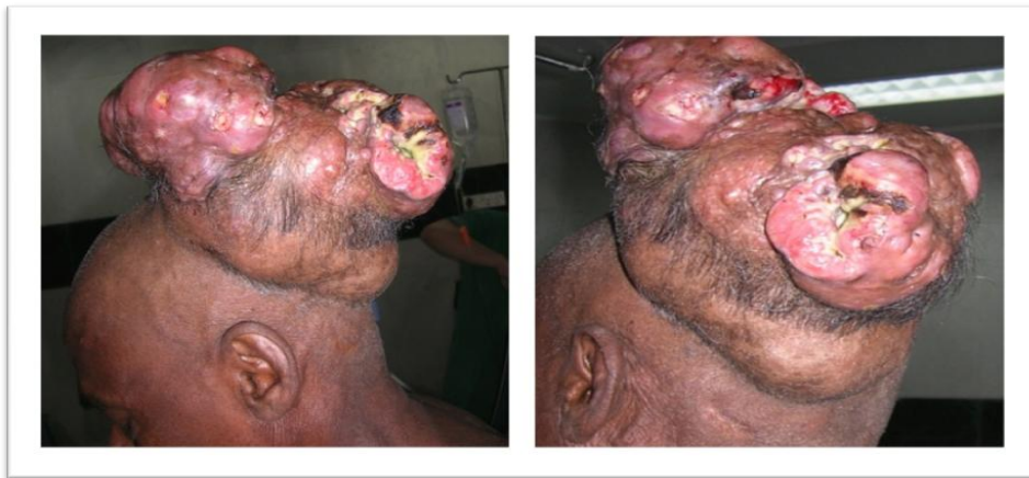
Fig 1:preoperative mass.

peaks were seen. The mean ADC value [0.5-0.8 \times 10^{-3} \text{mm}^2/\text{s}] was suggestive of high grade cellular lesion. Complete excision of the growth with left side modified radical neck dissection was done and the defect was covered with anterolateral thigh free flap, along with oncosurgery and plastic surgery team. Postoperatively, patient was conscious, oriented and ambulatory with no neurological deficits. Postoperative ct brain showed no evidence of mass. Histopathology confirmed the lesion as anaplastic meningioma-WHO grade III scalp. Three of six from level III lymph nodes were involved by tumour.