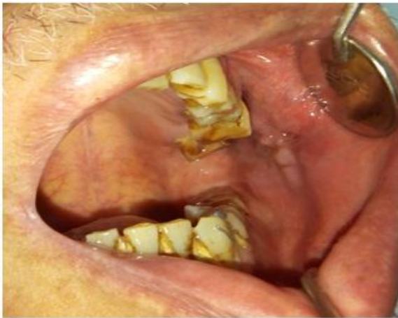
Figure 5- Intraoral picture at the 1 year post excision follow-up

present case there was no local recurrence at the follow-up of 1 year after treatment. [Fig5]