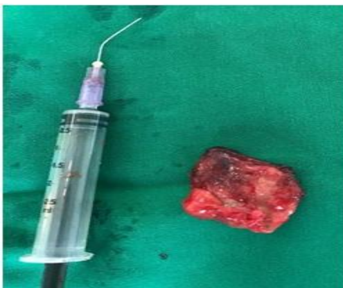
Figure 3 - Post operative Specimen after enucleation in toto

Fine needle aspiration cytology (FNAC) of the lesion was done. The contents of the aspirate yielded a cheesy white material. FNAC revealed squamous cells and cholesterol clefts without any inflammation or atypical cells, which