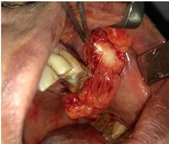
Figure 2 - Intraoperative picture showing the exposure for removal of the the cyst