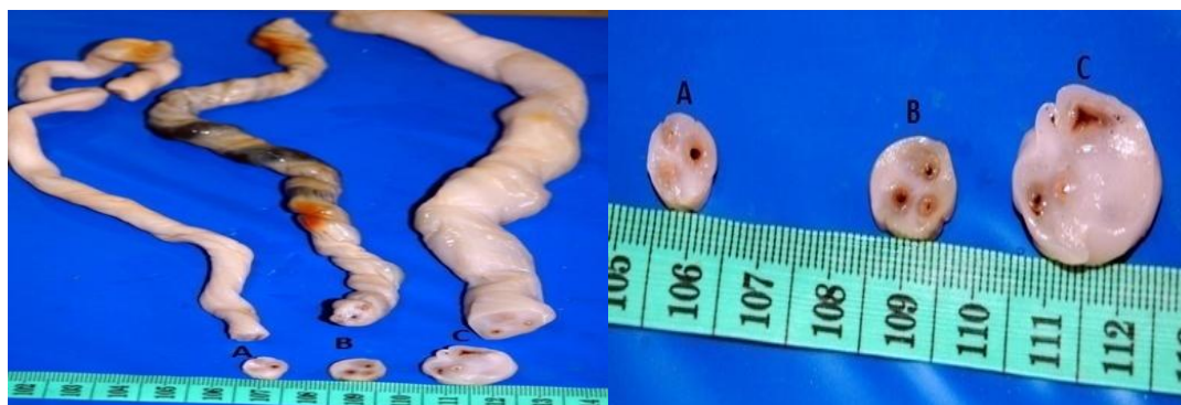
(Figure 3): shows diameter of the umbilical cord A. Cord with small diameter, B. Cord with medium diameter and C. Cord with large diameter