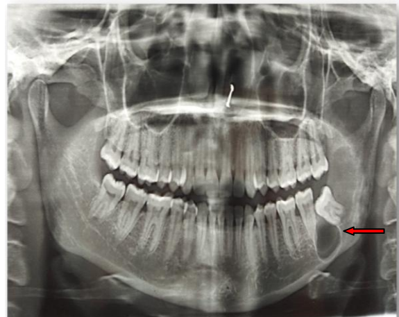
Figure 3. OPG showing presence of a well defined unilocular radiolucency irt to the lateral aspect of 38 approximating 2 cm in greatest dimension extending inferiorly upto 1mm above the inferior border of mandible and involving the distal aspect of the radicular portion of 37.

taken and sent for histopathological examination using H&E stain.