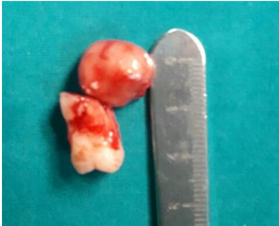
Figure 5. Gross picture of the excised specimen showing presence of a cyst attached to the apical 3 rd of tooth root.

Microscopic examination of the specimen revealed a keratin filled cystic cavity lined by 4-6 layers of orthokeratinized stratified squamous epithelium with prominent granular layer and columnar basal cells having palisading arrangement of nuclei. The epithelial-connective tissue interface was rather flat and devoid of rete ridges. Connective tissue capsule showed parallelly arranged bundles of collagen fibres infiltrated with minimal