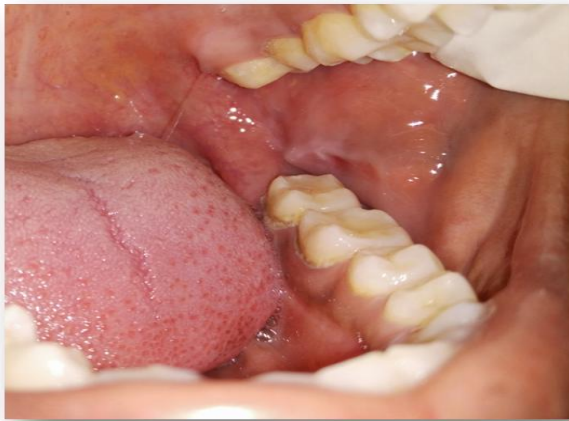
Figure 2. Intraoral photograph showing missing third molar.

taken and sent for histopathological examination using H&E stain.