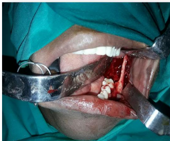
Figure 4. Intra operative picture taken during extraction of impacted 38

Gross examination of the excised specimen revealed a cyst attached to the apical 3 rd of tooth root, measuring about 10x8 mm in dimension, yellowish brown in colour. The cystic lumen was filled with white cheesy material. The sections where