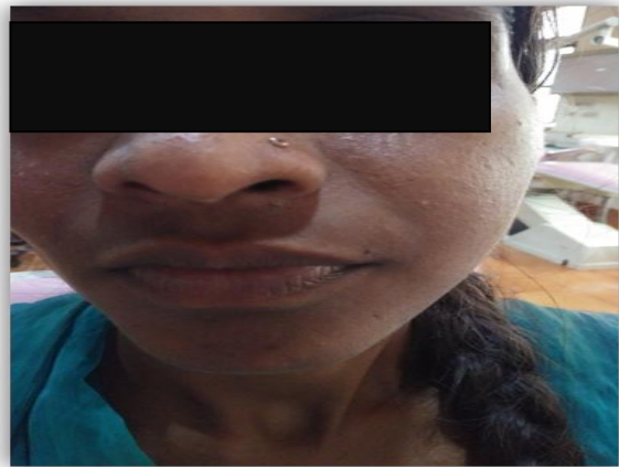
Figure 1. Extraoral photograph showing no visible changes.

laboratory findings were within normal range.