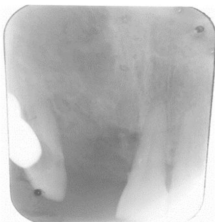
Figure 2: Intra-oral Periapical radiograph showing no bony changes

Extra-oral examination revealed no significant clinical findings. Intraoral examination revealed a solitary swelling on the labial gingiva of the maxilla in relation to maxillary right central and lateral incisor