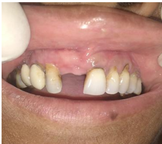
Figure 4: Clinical intraoral photograph of follow-up after 6 months showing no recurrence