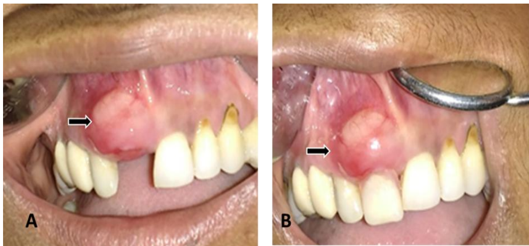
Figure 1: Intraoral photograph showing A: lesion on labial gingiva in relation to maxillary right central and lateral incisor region B. Same lesion with the insertion of RPD

months. Patient gives history of similar type of growth in the past two years for which she consulted private dentist where excision of the lesion along with the extraction of maxillary right central incisor was done. No histo-pathological record of the previous surgery was available. After the complete healing of the excised site removable partial denture was fabricated and given to the patient. There was associated history of trauma due to sharp flange of removable partial denture. The patient's medical history and family history were non-contributory.