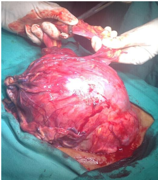
Mass of 16*13 cm attached to uterus on right cornua

herself and her parents were counselled and informed consent was taken after explaining the gravity of the problem). On gross examination tumour measuring 16x13x5cm, globular, outer surface smooth and encapsulated. Uterus and cervix with one sided adnexa measuring 9x3x1.5 cm. Right sided ovary measures 3x2cm fallopian tube measure 7x1.2cm. The HPE report revealed tumour mass composed of immature neural element in form of cellular glial tissue and neuroepithelial rosettes. IMPRESSION: Tumour mass - Immature teratoma, ovary - multiple follicular cyst, corpus albican, uterus was normal.