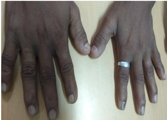
Figure 2: Loss of skin crease over DIP of 2 nd , 3 rd and 4 th fingers

Blood investigations namely complete hemogram, erythrocyte sedimentation rate, C-reactive protein, blood urea and serum creatinines were normal. Urine routine, including protein creatinine ratio was normal. Ophthalmological evaluation was unremarkable. Radiograph of knees showed hypoplastic patella on both sides (figure 6). Radiograph of pelvis showed bilateral short and broad femoral head and bilateral prominent posterior iliac horns (figure 7). Ultrasound abdomen was normal. MRI pelvis with both hips revealed articular cartilage thinning of both femoral head and