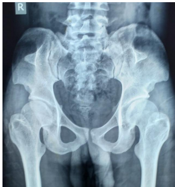
Figure 7: Radiograph of pelvis showed bilateral short and broad femoral head and bilateral prominent posterior iliac horns