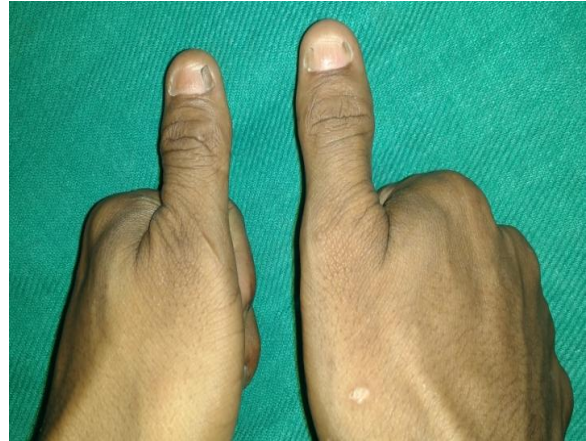
Figure 3: Thumb nail dystrophy

acetabulum, short and broad femoral head and bilateral prominent iliac horns. No evidence of joint effusion or avascular necrosis of femoral head (figure 8). He was treated with analgesics, anti-resorptive therapy and other supportive measures. Regular physical therapy and follow up was advised.