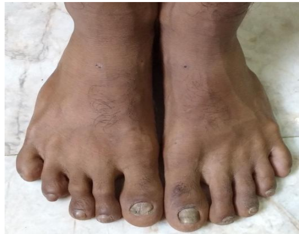
Figure 4: Toe nail dystrophy