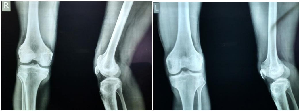
Figure 6: Radiograph of both knee showing hypoplastic patellae