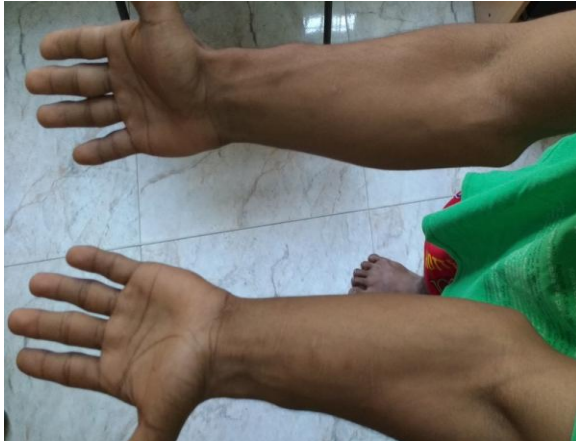
Figure 1: Prominent medial epicondyle with restriction of complete supination in right forearm

4). Knee examination showed prominent sulcus in between femoral condyles (figure 5). On palpation, both Patellae were small and superiorly located. Examination of hip revealed positive Patrick's test (FABER), with pain localised to hip joint. There was painful limitation of internal rotation of both hips. The power of quadriceps, hamstrings and glutei muscles were normal.