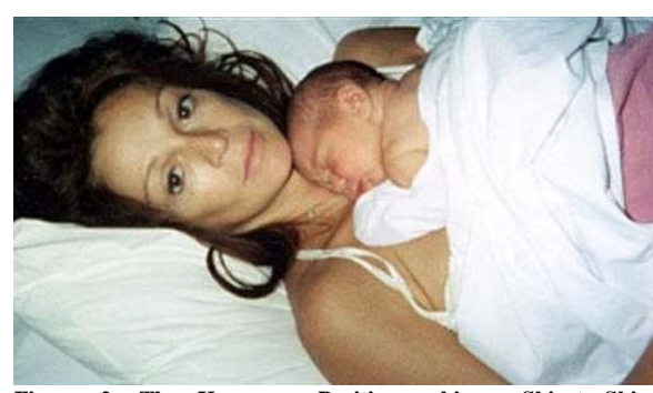
Figure 2: The Kangaroo Position achieves Skin-to-Skin Contact (SSC)

care. The evidence shows that SSC in the first two hours after birth programs infant self-regulation that is detectable in 12-month follow-up. (20) SSC is a central feature of and facilitates Step 4 of the WHO-UNICEF Ten Steps to Successful Breastfeeding, (21) part of the Baby-Friendly Hospital Initiative (BFHI)(Table 1).