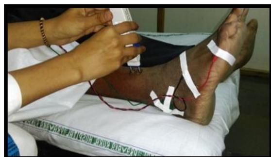
Placement of the Electrode for Sensory & Motor nerve conduction velocity