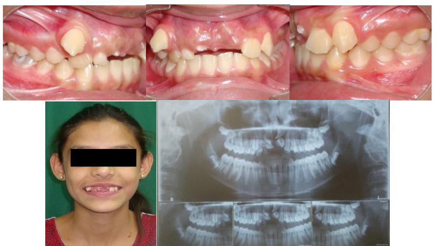
Fig1:Pre-treatment intra-oral, extra-oral photographs and OPG

incisors, with two supernumerary teeth in relation to maxillary central incisors [fig 1]. Cephalometric radiograph revealed class III skeletal base due to retrognathic maxilla and prognathic mandible with average growth pattern. CBCT images showed horizontally impacted supernumerary teeth in relation to maxillary anterior region and permanent maxillary central incisors above and palatal to the supernumerary teeth [fig 2].