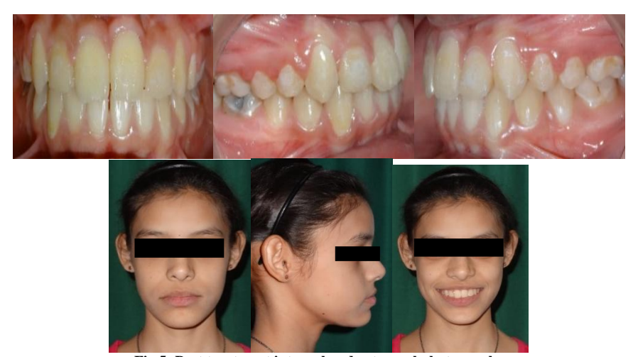
Fig 5: Post treatment intaoral and extraoral photographs

A well-interdigitated Angle's class I molar and canine relationship was obtained on both sides at the end of treatment [fig 5]. Well aligned maxillary anteriors with acceptable overjet, overbite and aesthetically pleasing smile. Brackets and bands were removed. The upper and lower arch retention was managed with a Hawley removable appliance. Patient was advised to wear the appliance full time during first 6 months followed by night time wear for next 6 months.