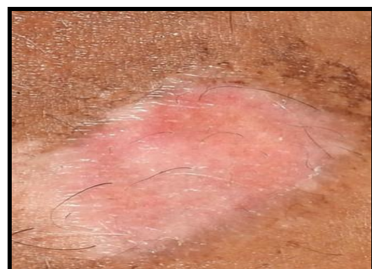
Fig. 3 Perifollicular erythema developing after two weeks of procedure.