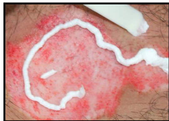
Fig. 2 Minute bleeding points after laser dermabrasion.