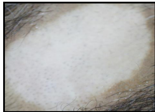
Fig. 1 vitiligo patch in chest

Transient hyperpigmentation in 3 patients and recurrence in 2 patients.