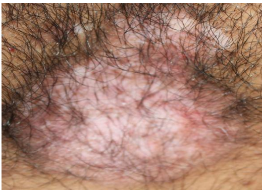
Fig. 6 Peripheral repigmentation after 3 months