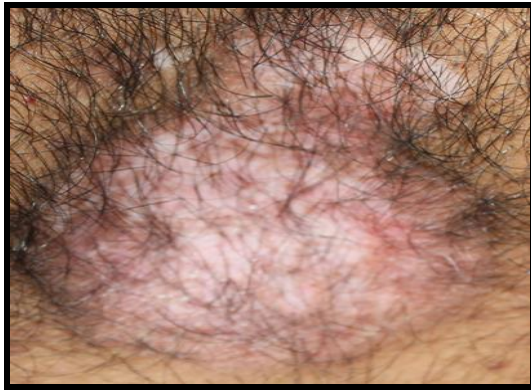
Fig. 4 Peripheral repigmentation after three months