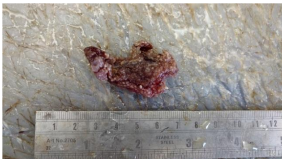
Figure 2. Omental tissue

Histopathological examination of the ovary revealed features of immature teratoma comprising of mature elements like skin, dermal appendages, bony trabeculae, cartilage, salivary glands,