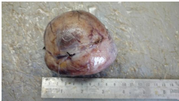
Figure 1. Right ovary

In container labelled as omental tissue, an irregular bit of omental tissue measuring 5cm X 3cm was present.