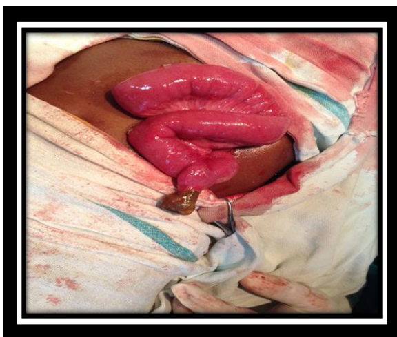
Figure 1: Meckel's diverticulum in a nine year old boy.

Post-operative period was uneventful for both patients. On follow up after three months, patients remained symptom free. Female patient was followed up post-operatively for six months and remained asymptomatic.