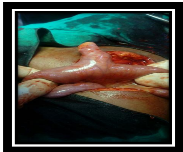
Figure 3: Incidental finding of Meckel's diverticulum in a twenty-two year old woman.