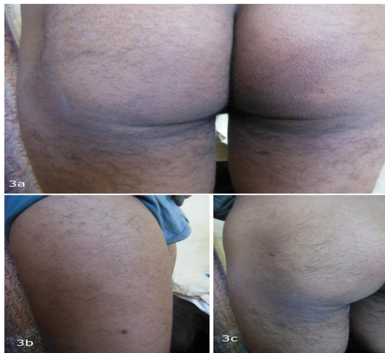
Figure 3: (3a) Significant improvement in hypopigmentation and atrophy over the lesions after 3 months of PUVA therapy, (3b) lesion on the right leg getting skin colored after the treatment, (3c) clearing of the lesions on left gluteal area.