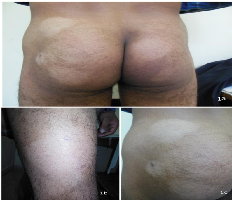
Figure 1: (1a)- Multiple hypopigmented patches over lower back and gluteal region variable in size, (1b)- hypopigmented patch on right thigh, (1c)- hypopigmented patches showing subtle atrophy and minimal induration.

The patient was started on photochemotherapy with Psoralen-UVA (PUVA), with three sessions per week. There was gradual decrease in induration and atrophy, and improvement in the colour of the lesion over next 3 months (Figure 3). The Patient was off PUVA after 6 months of treatment. The follow up till next 18 months after treatment didn't show any clinicopathologic evidence of relapse.