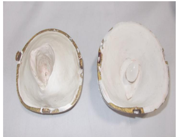
Figure 5: Lab procedure for the fabrication of ocular prosthesis

Insertion: Prosthesis was inserted into the socket, and checked for any areas requiring adjustment. Esthetics and comfort of the patient were evaluated. The patient was educated to insert and remove the prosthesis. Ophthalmic lubricant was advised for lubrication.