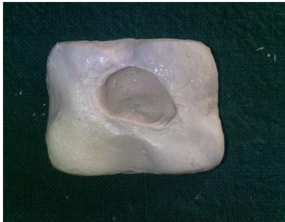
Figure 3: Cast Fabrication