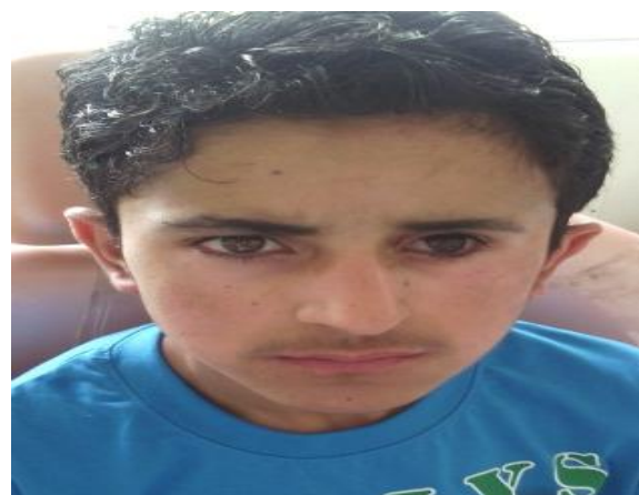
Figure 6: Patient with custom ocular prosthesis