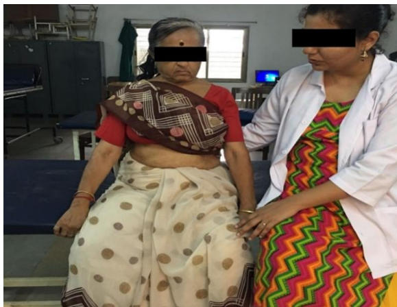
Figure 5: Progression in sitting

The isometric exercises for hip adductor muscles were given in crook lying. Subjects were asked to press pillow between the two knees. It is believed that isometric hip adductors irradiate the contraction to pelvic floor muscles and pelvic floor