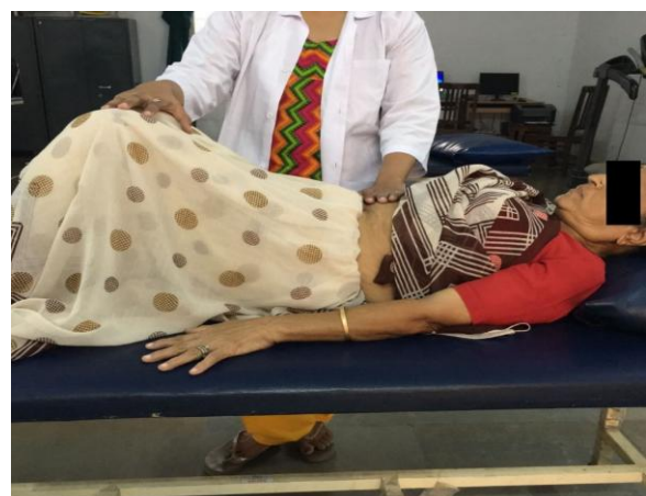
Figure 3: Transverse abdominis contraction and pelvic floor muscle contraction simultaneously

The pelvic floor muscle contraction along with transverse abdominis contraction was performed first in lying and then in sitting. It is believed that there is co-contraction of transverses abdominis muscle during PFM contraction. [12] So, transverses