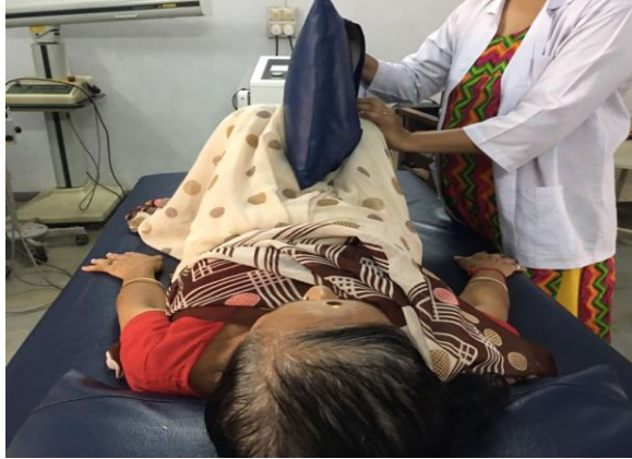
Figure 4: Hip adductor isometric and pelvic floor muscle contraction

abdominis muscle contraction with PFM contraction is now incorporated into treatment protocols. [13] For this reason, transverses abdominis contraction exercise was added with PFM exercise.