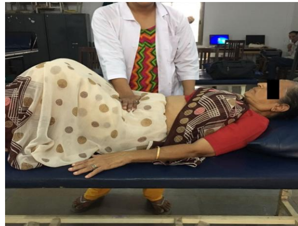
Figure 2: Pelvic floor muscle contraction

The pelvic floor muscle contractions were first taught in crook lying position. On the very first day, the physiotherapist exposed the part and checked for proper contraction. The patients were explained well how to contract the pelvic floor muscles. Once mastered, subject was asked to practice this in sitting position.