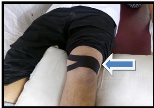
Figure 3.5a- Patellar taping

cleaned and dried. Kinesio tap was applied medially to the patella to provide medial glide, medial tilt and antero-posterior tilt to the patella and reduce strain on the infrapatellar pad or pes anserine. One end of the Y-shaped Kinesiotape was secured to the lateral patellar border and the patella was glided and tilted medially by the use of the thumb while maintaining 50–75% tension of the tape. It was applied up to medial border of medial hamstring tendon. Similarly, another I-shaped kinesio tape was applied slightly inferior to the first one as reinforcer and to reduce strain on infrapatellar pad or pes anserinus. [5,6,12,13]