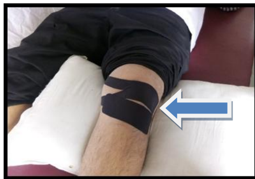
Figure 3.5b- Patellar taping

According to Kase Wallis principles of KT, a gap of at least 30 min was given after the tape application to achieve a complete activation of the glue, which is believed to improve the performance of the kinesiotape in patellar alignment correction. The tape was applied once a week for 3 weeks and was kept in place for 5 days after each application. [5,6,12,13]