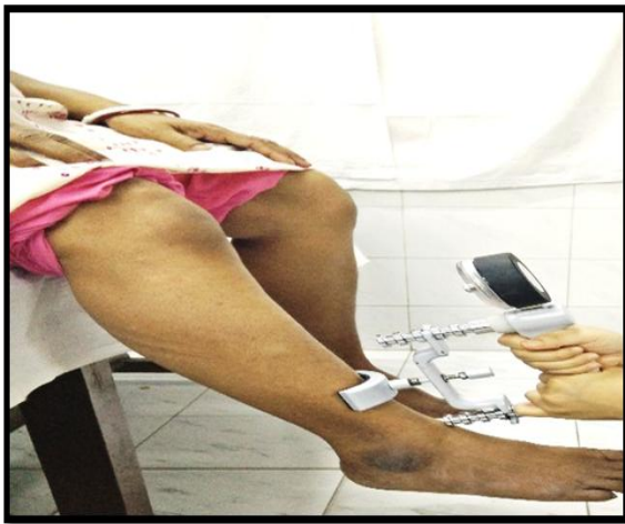
Figure- 3.4: Measurement of knee extensor strength

against the therapist hand as a trial to check if they were performing the contraction correctly. Then an additional practice trial, in the form of an MVC against the HHD was applied. The individual test was administered 3 times to reduce a possible learning effect & the mean of the three values was recorded in kg (kilogram), because these procedures are commonly applied in MVC testing. There was a 30 second rest period between each trial. [9] The readings were taken at baseline marked as MS0, at the end of 3 weeks of treatment marked as MS1 and at 3-week follow-up marked as MS2.