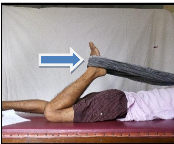
Figure 3.7: Quadriceps stretching exercise

2) Quadriceps Stretch: Subjects was in prone position on treatment table (Figure-3.7). Both hips and knees extended. A band of cloth was placed around the ipsilateral ankle and brought posteriorly and superiorly over the ipsilateral shoulder. The subject grasped the band of cloth in the ipsilateral hand and bent the knee by straightening his/her elbow and pulling on the band of cloth. The knee was progressively flexed until a gentle stretch was felt in the anterior thigh. This position was held for 30 seconds and repeated 3 times. Between each repetition there was a rest periods of 5 seconds. [16,17]