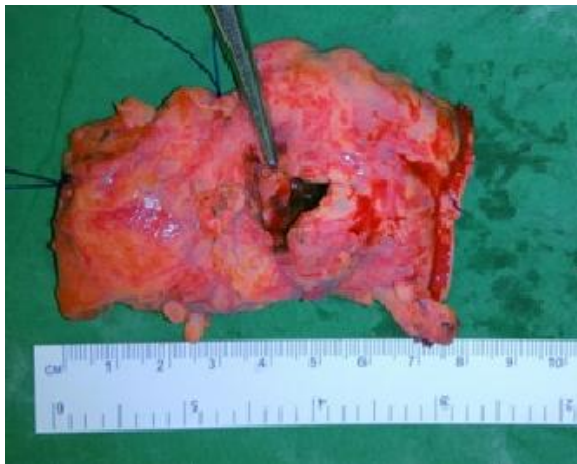
Fig 2. Case 1, Operative Specimen - Posterior aspect of distal pancreatectomy specimen with the splenic artery aneurysm. The artery forceps pointing to the opening made on the aneurysm.

of the splenic artery with intra luminal thrombus. Upper GI endoscopy showed large esophageal varices, endoscopic banding of these varices done. Patient was planned for aneurysmectomy with splenectomy and esophago-gastric de-vascularization. Intra-operatively the aneurysm was adherent to the pancreas. Splenic artery was ligated 1 cm distal to its origin and distal pancreatectomy with splenectomy with esophago-gastric de-vascularization was done (Fig.2). Post-operatively, patient developed ascites, which responded to diuretics, otherwise an uneventful recovery.