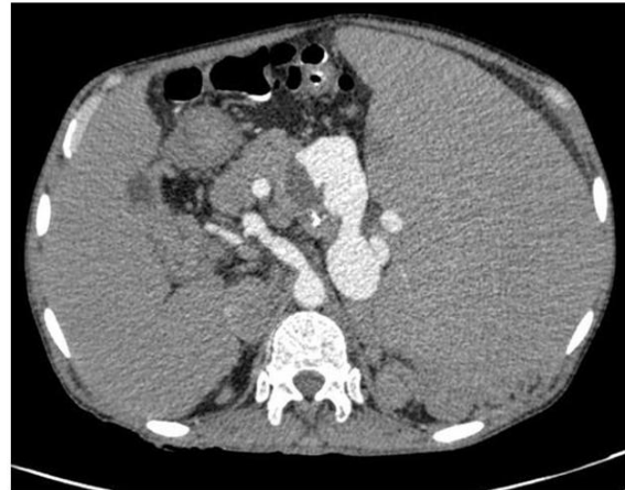
Fig 1. Case 1, CT scan of patient showing the SAA.

vein was 6 mm in diameter. Patient underwent ligation of the splenic artery proximal to the aneurysm with de-vascularization procedure. Post-operatively, patient developed ascites, managed with diuretics, otherwise uneventful post-operative course.