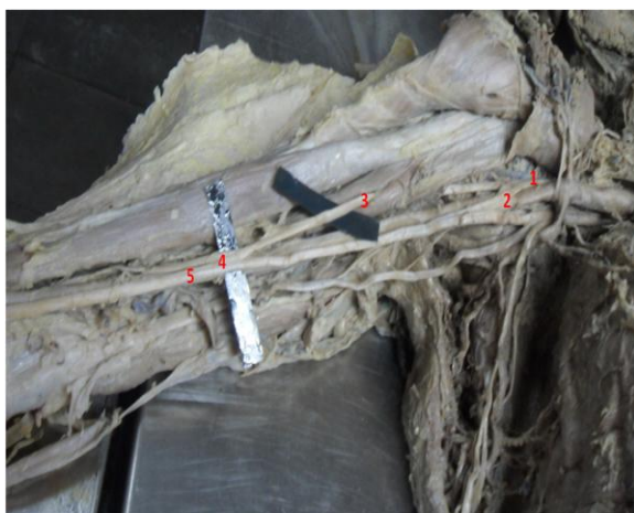
Fig 4: Type 2 Group C: 1-Lateral cord, 2-lateral root of median nerve, 3-MCN, 4-communicating ramus, 5-Median nerve.