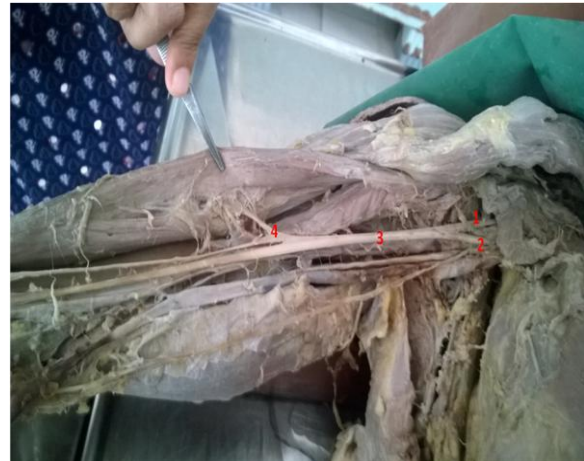
Fig5: Type 4-group A: 1&2 -lateral root & medial root of median nerve, 3-median nerve with fibres of MCN, 4-MCN separated from median nerve, gives muscular branches to biceps, brachialis and continues as lateral cutaneous nerve of forearm.