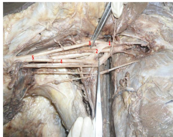
Fig7: Type 5-group B: 1-Lateral cord, 2-lateral root of median nerve, 3-MCN with branches to coracobrachialis, 4- Median nerve, 5-complete fusion of MCN and MN.

In the peripheral nerve surgery, especially in nerve transfers techniques, a good knowledge of the MCN-MN communications is required. The MCN has