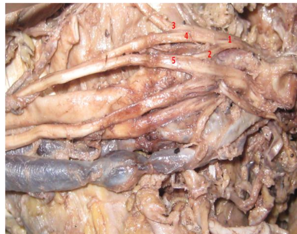
Fig 2: Type 2 Group A: 1-Lateral cord, 2-lateral root of median nerve, 3-MCN, 4-communicating ramus, 5-Median nerve.

Figures 2 to 7 - showing various types of Communications between median & Musculocutaneous Nerves.