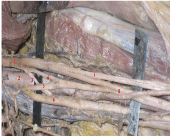
Fig: 1 1-lateral cord, 2-axillary artery, 3-lateral root of ulnar nerve (Fuzz Type I group b), 4-proximal root of median nerve, 5-medial root of median nerve, 7-musculocutaneous nerve, 8-communication of MCN with MN (Kaur & Singla Type 2 Group B)

communicating ramus from lateral root of median nerve and Type b nerve fibres of lateral root of ulnar nerve passed deep to the medial root of median nerve. The incidence of lateral root of ulnar nerve is in the present study is 11.11% (10 out of 90 upper limbs).