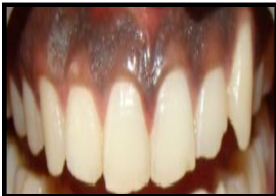
Figure 9- Pre op pic

1 st quadrant and laser was done on 2 nd quadrant