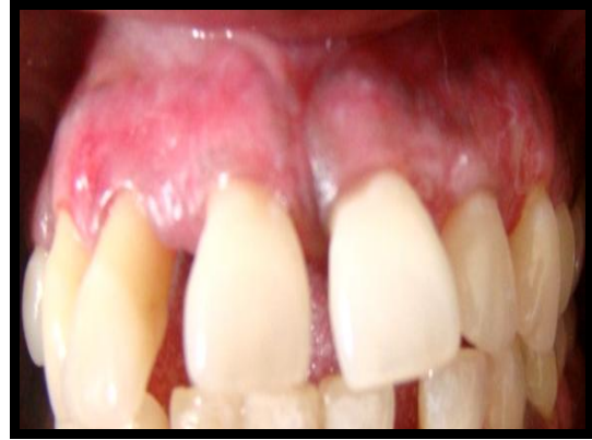
Figure 2- 1 week post op pic