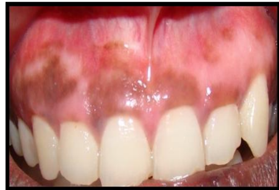
Figure 12- 1 year follow up