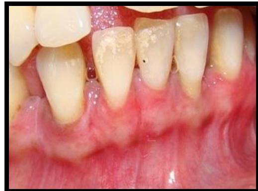
Figure 6 - 1 week post op