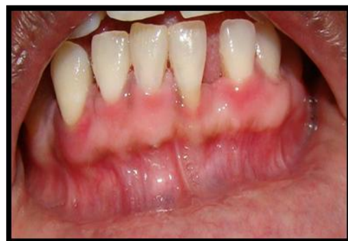
Figure 8 - 1 year follow up