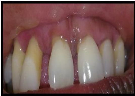
Figure 3 - 6 th month follow up