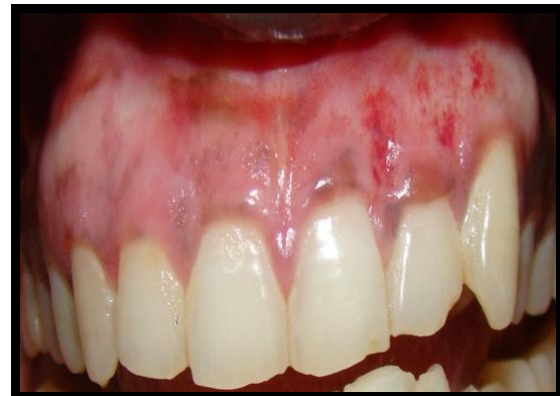
Figure 10- 1 week post op pic