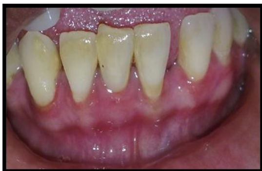
Figure 7- 6 th month follow up