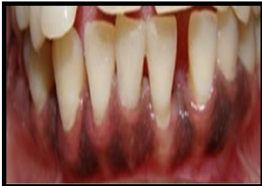
Figure 5- Pre op pic

and Electrocautery was done on 3 rd quadrant