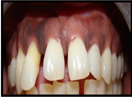
Figure 1- pre op pic