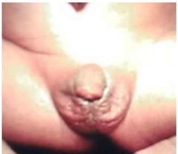
Fig. 2: A newborn baby girl (46 XX) with congenital adrenal hyperplasia due to 21 hydroxylase deficiency. Note: The fused labioscrotal folds and hypertrophy of clitoris

Metabolite 17-alphasuch as hydroxyprogesterone (17-OHP), androstenedione, dehydroepiandrosterone (DHEA), cortisol testosterone, aldosterone and renin should be assayed to determine the clinical variant of CAH. A profile of steroid metabolites is required to evaluate (2-5,11,47,48) the clinical cause of CAH. Aliuravyan has reported his experience from Saudi Arabia previously. (18,49)