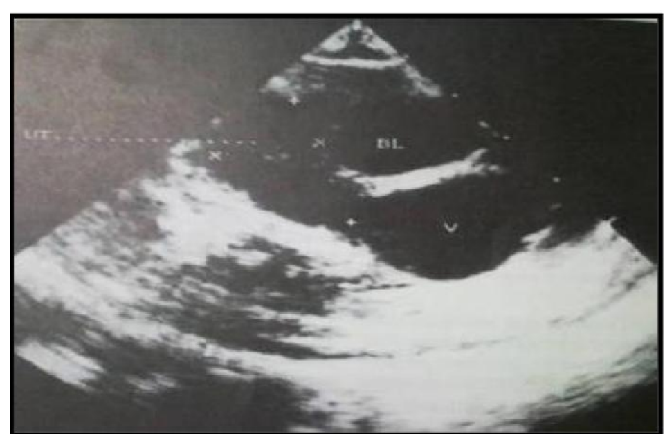
Fig. 4: 1 Pelvic ultrasonography of a patient with 46XX DSD, showing a uterus. She was diagnosed with congenital adrenal hyperplasia, 21-alpha-hydroxylase deficiency.

Surgical correction is a complex clinical situation that requires a multidisciplinary approach. The type of surgical repair performed must be tailored according to each individual patient's anatomy. Reconstruction is generally initiated between the age of 3 and 6 months. (3-10,56-65)