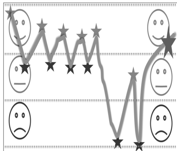
Figure 1: Sample of a River of Life

Each question is fortified with necessary probes and channelizing questions. The sixty minute session is divided into five un-equal sections of time giving more importance (time) to the present and the future. The therapist takes a supportive stance when talking about the negative experiences and facilitates ventilation. While talking about the positive experiences, the therapist gathers a more encouraging stance and facilitates enthusiasm.