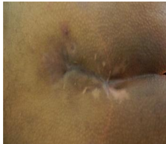
Figure C & D Image Showing the Pilonidal Sinus After the healing

Before planning treatment Patient was assessed for fitness for anaesthesia and surgery. After giving spinal anaesthesia debridement of the Pilonidal tract is done with scoop. Hairs and unhealthy granulation