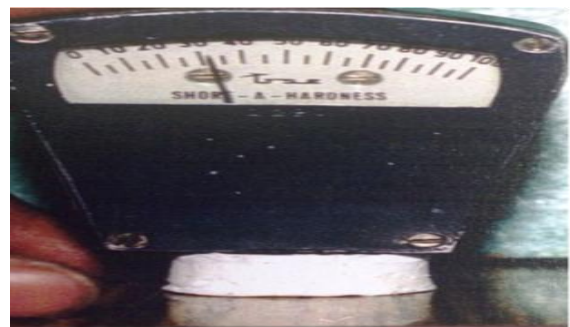
Fig:6 SHORE A DURAMETER HARDNESS TEST