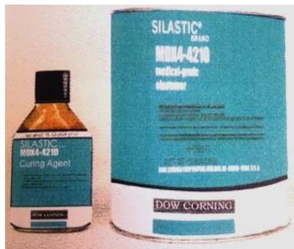
Fig.1 Medical Grade Silicone

Preparation of samples for C: Dies dimensions of 24mm diameter and 12mm thickness. 10 samples were prepared for each material and total no of 20 samples (Fig:5). The samples are subjected to SHORE A HARDNESS TEST (Fig: 6)