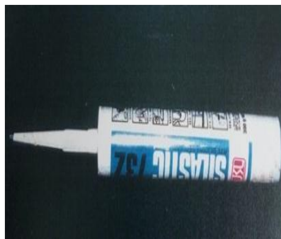
Fig.2 Industrial Grade silicone