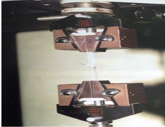
Fig.3. Lloyd's Shear strength machine