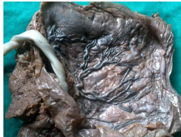
Fig.2 Fetal surface of placenta with thickened vessels

Microscopic Examination: Microscopy of the grossly normal appearing placenta showed mature third trimester villi with normal histology. Sections taken at the junction showed normal and vesicular villi adjacent to each (Figure 3). The grape like clusters demonstrated markedly edematous vesicular villi with circumferential trophoblastic proliferation (Figure 4). Trophoblastic cytological atypia was also