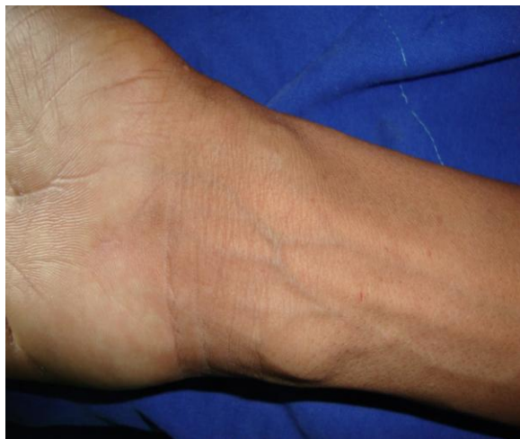
Figure 1: swelling on flexor aspect of the wrist

with time. There was no history of fever, loss of weight or appetite, night sweats, malaise or fatigue, trauma, pain in other joints of the body, morning stiffness or continuous use of vibratory tools. On examination there were localized tender swelling of 5x3 cm and 4x2 cm over the ulnar and radial border respectively on the palmar aspect of wrist and another fusiform swelling over ulnar border of hand on dorsal aspect measuring 5x3 cm. Movements of wrist were restricted and painful. Cross fluctuation was present on the volar aspect with a gurgling sound. Laboratory investigations revealed erythrocyte sedimentation rate of 90 mm/hr. Fine needle aspiration cytology showed features suggestive of ganglion. Chest radiograph was normal. Radiograph of wrist showed destruction of the pisiform bone and a lytic lesion in the scaphoid (Fig-3). Ultrasound studies of the wrist showed circumferential thickening of the tendon of flexor carpi ulnaris, flexor pollicis longus, and extensor digiti minimi.