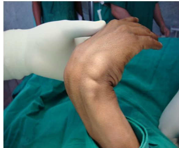
Figure 2: swelling on extensor aspect of the wrist

presence of large 'melon seed bodies' within the sheath (Fig-4).