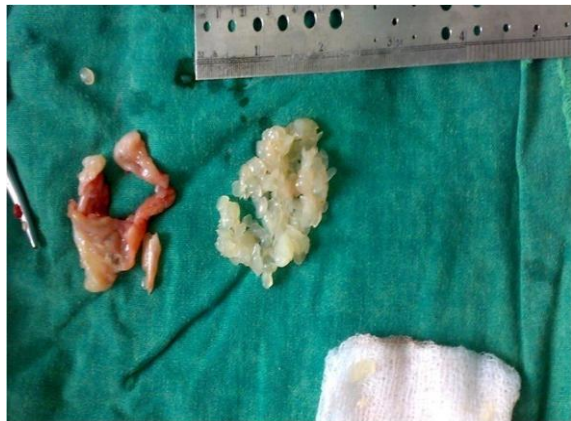
Figure 4: Hypertrophied tendon sheath and melon seed bodies

evidence of recurrence at end of follow up. Patient had palmar flexion of 50 degrees and dorsiflexion of 60 degrees Modified Mayo wrist score was 65.