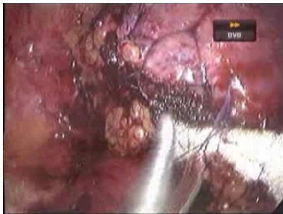
Figure 3: Bolsters being applied.

With the patient in left lateral position, pneumoperitoneum was created. Ports were placed in the right subcostal region in the mid-clavicular, anterior axillary, mid-