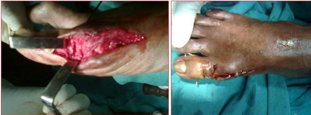
Figure 2: Surgical Technique: Wedge of bone removal with Clinical photograph after Surgery

closure. Kirschner wire fixation done. Medial capsulorrhaphy- the medial capsule was closed with absorbable sutures to hold the toe in the corrected position. The skin was closed with interrupted sutures, and a bulky compressive dressing was applied (fig.2)