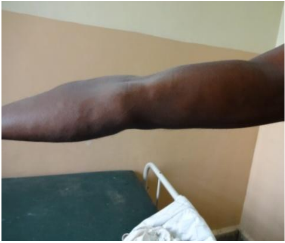
Fig 2: Neurofibromas along ulnar nerve