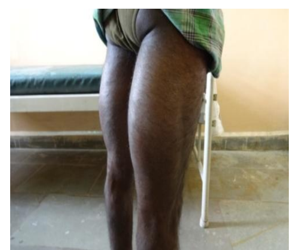
Fig 3: Bilateral thickened sciatic nerves