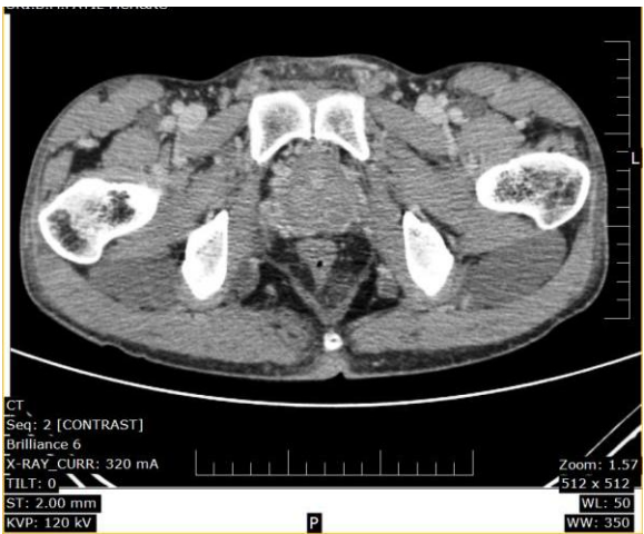
Fig 6: Contrast-CT of pelvis showing enlarged prostate with heterogenous enhancing areas