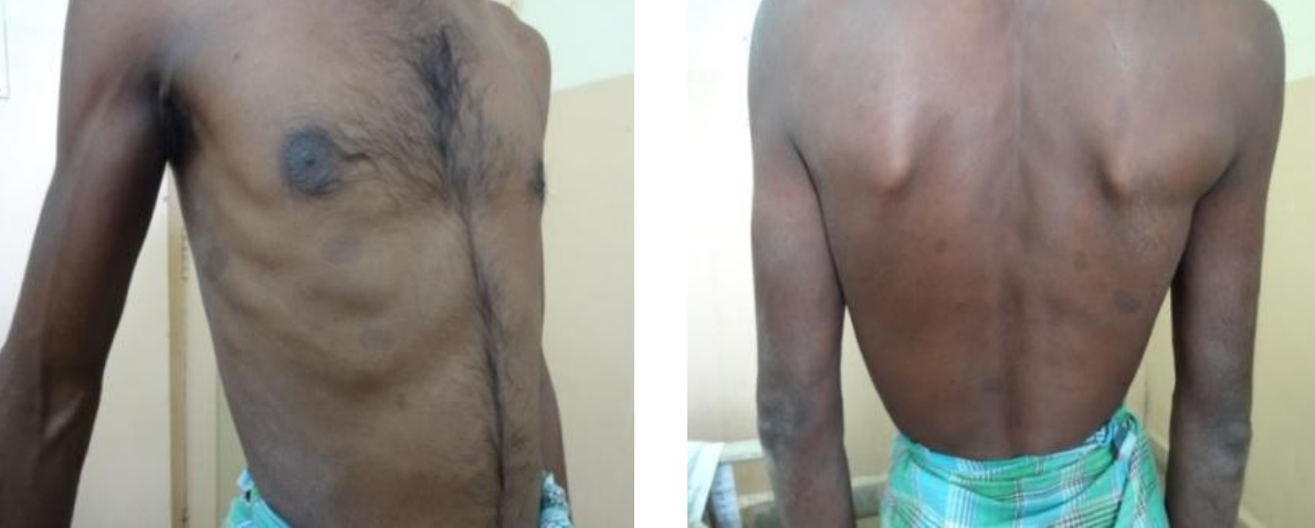
Fig 1: Cafe-au- lait macules over lumbar area

On examination, multiple café au lait spots were present on his body (Fig 1), with swelling in the posterior aspect of both the thighs and medial aspect of both arms (Fig 2, 3) palpation of which caused tingling and pain. B/L proptosis was present. Multiple swellings could be palpated in the posterior triangle of neck and abdomen. Power in the upper limb and lower limb muscles were normal. Per rectal examination revealed prostatomegaly with normal grade 2 sphincter External tone. genitalia examination was normal.