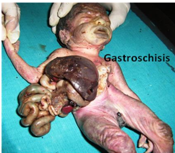
Fig 1: Right sided Gastroschisis.

The defect is paraumbilical with evisceration of stomach, liver, gall bladder, small bowel loops, large bowel loops which were normal, no membranous covering, no cardiac and urogenital involvement but associated with kyphosis and scoliosis towards right side with congenital talipes equino varus (CTEV) on left side. (Fig 1, 2).