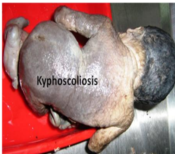
Fig 2: Kyphoscoliosis.