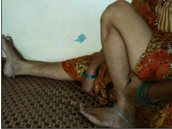
Figure 6 Range Of Motion at Knee (Full Flexion)