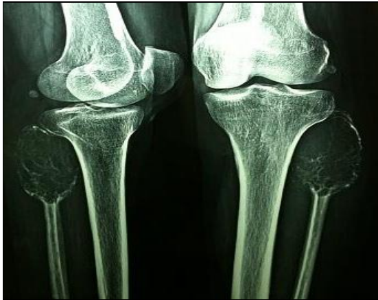
Figure 1 Pre Op X-Ray

thereafter for every 3 months. X ray knee was taken on every follow up to see any evidence of recurrence. No recurrence has been seen in 51/2 years of follow up (figure 4).