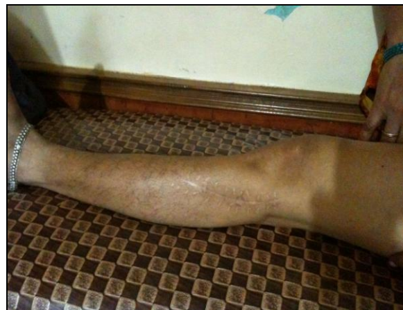
Figure 5 Range Of Motion at Knee (Full Extension)

Microscopy was consistent with the diagnosis of giant cell tumor. Multinucleated giant cells with oval shaped stromal cells were seen (figure 2). There was no evidence of wound infection in post operative period. Patient was discharged after suture removal. Patient could comfortably bear weight after 3 weeks of surgery with full range of knee movement (figure 5 & 6). Patient was followed up every month for 3 months and