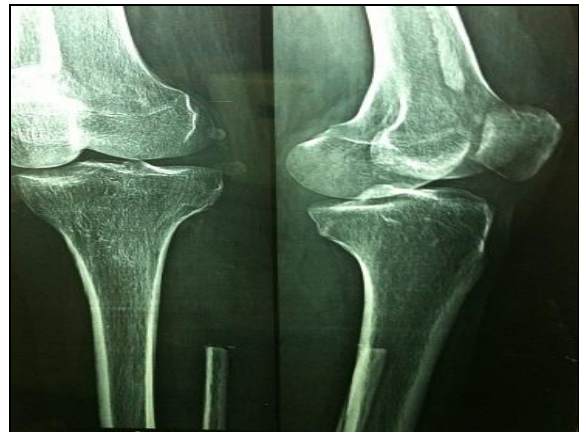
Figure 4 Post Op X-Ray

Microscopy was consistent with the diagnosis of giant cell tumor. Multinucleated giant cells with oval shaped stromal cells were seen (figure 2). There was no evidence of wound infection in post operative period. Patient was discharged after suture removal. Patient could comfortably bear weight after 3 weeks of surgery with full range of knee movement (figure 5 & 6). Patient was followed up every month for 3 months and