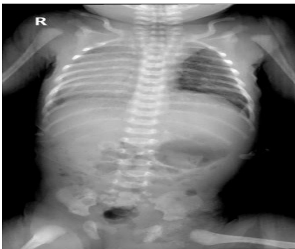
Figure 1 chest x ray

Echocardiography revealed situs ambiguous, dextrocardia, IVC connected to large common atrium, Right atrial isomerism, only one coronary sinus seen. Pulmonary veins connected to large common ambiguous atrium and 2 small muscular VSD, large perimembranous VSD, single common AV valve with pulmonary hypertension, right ventricle larger than left and both vessels arising from right ventricle with transposition of great vessels. No aortic stenosis or pulmonary stenosis, pulmonary valve larger than aortic valve, ascending aorta and proximal aortic arch normal, distal arch and preductal descending aorta narrowed. PDA moderate size with left to right shunt. Normal coronaries and postductal descending aorta.