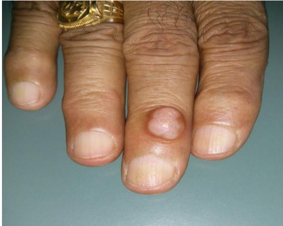
Figure 1: The solitary, translucent, dome shaped papule over the finger.