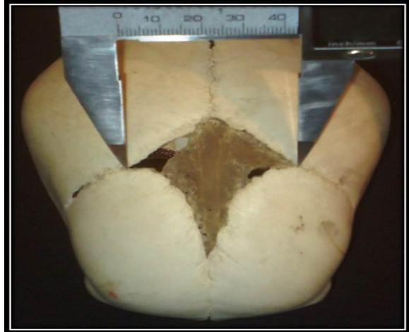
Fig 1,1a; Measurements of anterior-posterior and transverse chord length estimated using Vernier Calipers.