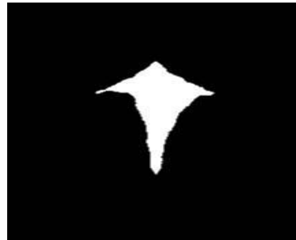
Fig 3: original (left) and numerical model (right).