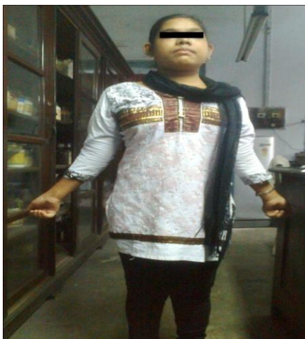
Figure 2: Cubitus valgus.