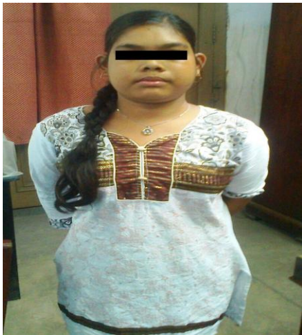
Figure 1: Broad chest and slight webbing of neck.

mother. She was adequately vaccinated; breast fed and had attained the developmental milestones well within time. Despite being reared in a well-to-do family, she started lagging behind her peers in height after ten years of age. She never developed axillary or pubic hair and had underdeveloped breasts. A delayed menarche was followed by irregular menses which finally ceased six months back. She had normal schooling and is now doing her bachelor's in college. Past medical history was negative for mumps, tuberculosis or any major systemic illness. Her brother had normal physical and mental development.