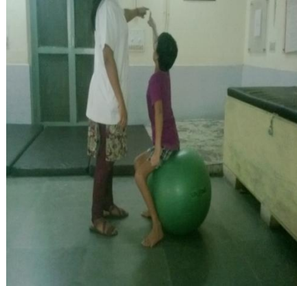
Fig 5 and Fig 6:- Ball catching and throwing in diagonal direction with different speed and reaching activities in different direction were performed with patient sitting on a gym ball with both his foot supported on a ground and with patient standing on a floor.