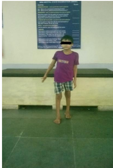
Fig 4:- Tandem stance.

Cool down: There was a 10-minute cool down where the participants performed gentle stretches, and then in a seated position practiced relaxation and controlled breathing.