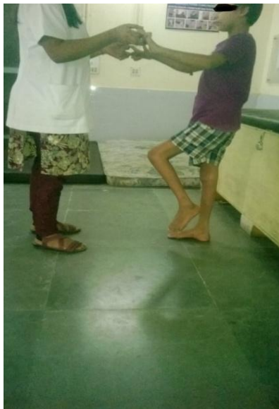
Fig 3:- Weight shifting exercise, single limb loading.

Balance exercise: For improvement of balance, functional exercises like weight shifting exercise, single limb loading (fig.3), tandem stance (fig.4) were done. Ball catching and throwing in diagonal direction with different speed and reaching activities in different direction were performed with patient sitting on a gym ball with both his foot supported on a ground and with patient standing on a floor ,were given (fig.5 & 6). It was done for 60 min. thrice a week.