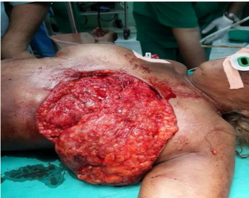
Fig. 1 Traumatic avulsion of left breast.

left sided open pneumothorax (fig 1). Air entry was absent on left side. Blood investigations were within normal limits. Patient was posted for emergency operative procedure where evidence of fracture left first, fifth, sixth ribs were noted along with left open pneumothorax and left traumatic breast avulsion (fig 2). No injury to the lungs was noted. Patient underwent left pleural closure with fixation of left 1 st rib with left simple mastectomy with left intercostal drain tube insertion. Post operative period was uneventful. Following development of healthy granulation tissue over chest wound patient underwent split thickness skin grafting. Graft was accepted well and patient was discharged after 21 days with follow up on outpatient department basis (fig 3 & 4).