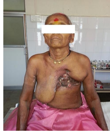
Fig. 3 Post operative.